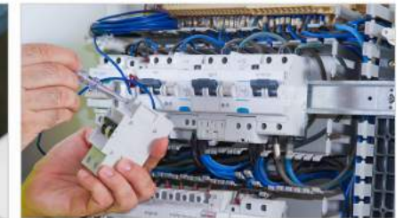
Dispatch Inspection & Testing