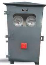
• Marshalling box