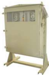
• Cooler Control